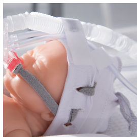
Simple fixation with bonnets to fit most infants