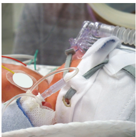
nCPAP is proven to be beneficial in supporting infants with respiratory problems