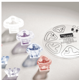
Comprehensive range of prongs and masks